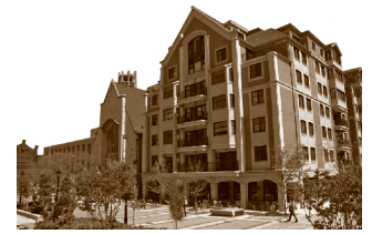
PH APARTMENT UPDATE

As dusk falls earlier and the temperatures drop residents keep flocking to the monthly Drop-In Dinners. Whether providing a supportive community for students in recovery from addiction, or an opportunity to work together on a project through the Micro-Community Program, or facilitating the exploration of future callings and direction through vocational reflection, PH Apartments continues to foster community and connection in the midst of college life. ✿