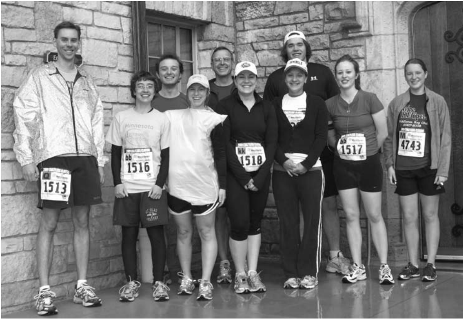
A group of students, board members, and staff braved wind and rain to run in the 8K Crazy Legs Classic that supports UW–Madison Athletics.

PRES HOUSE SEEKS TO BE A SPIRITUAL HOME AT THE HEART OF THE UNIVERSITY OF WISCONSIN–MADISON CAMPUS. IN KEEPING WITH THE TEACHINGS OF JESUS CHRIST AND THE CHRISTIAN TRADITION OF HOSPITALITY, PRES HOUSE IS DEDICATED TO PROVIDING A RELIGIOUS CENTER AND HIGH QUALITY STUDENT HOUSING TO PROMOTE THE SPIRITUAL, EMOTIONAL, AND INTELLECTUAL GROWTH OF RESIDENTS AND MEMBERS OF THE CAMPUS COMMUNITY. PRES HOUSE IS A MINISTRY OF THE PRESBYTERIAN CHURCH, U.S.A., AND WELCOMES INDIVIDUALS OF EVERY PERSPECTIVE AND BACKGROUND.