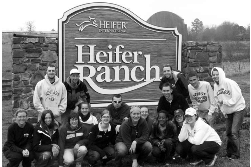
Students and staff spent their spring break taking part in the Global Passport Program at Heifer Ranch in Perryville, Arkansas.

On our first morning at Heifer, we were sent through “Customs” and sorted according to our destinations. We spent the remainder of the week in family units from Mozambique, Tibet, and the Mississippi Delta region. In order to make the experience as genuine as possible, we lived in authentic dwellings, prepared meals appropriate to our region, and completed the necessary chores to support our families. I found myself