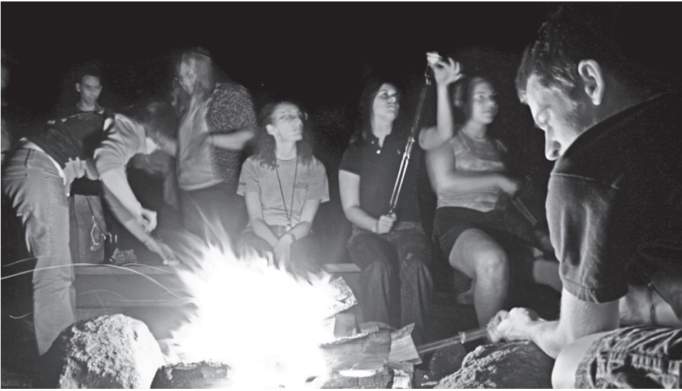
The new academic year kicked off with a number of events this fall, including this Friday night bonfire at Picnic Point.