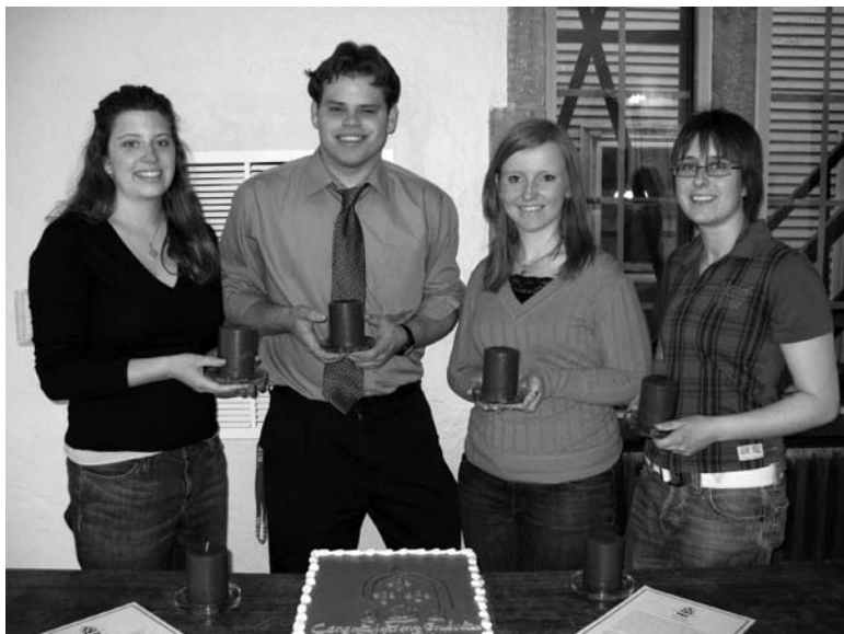
Four graduating seniors hold candles from a special ceremony reminding them of their role as light and salt to the world.

PRES HOUSE SEEKS TO BE A SPIRITUAL HOME AT THE HEART OF THE UNIVERSITY OF WISCONSIN-MADISON CAMPUS. IN KEEPING WITH THE TEACHINGS OF JESUS CHRIST AND THE CHRISTIAN TRADITION OF HOSPITALITY, PRES HOUSE IS DEDICATED TO PROVIDING A RELIGIOUS CENTER AND HIGH QUALITY STUDENT HOUSING TO PROMOTE THE SPIRITUAL, EMOTIONAL, AND INTELLECTUAL GROWTH OF RESIDENTS AND MEMBERS OF THE CAMPUS COMMUNITY. PRES HOUSE IS A MINISTRY OF THE PRESBYTERIAN CHURCH, U.S.A., AND WELCOMES INDIVIDUALS OF EVERY PERSPECTIVE AND BACKGROUND.