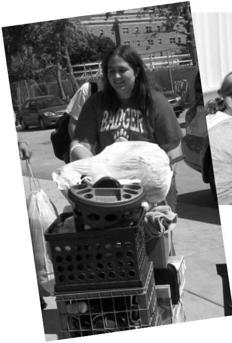
Another academic year brings new students moving into the Pres House Residence. A pizza party and ice cream sundae extravaganza provided opportunities for neighbors to become friends.