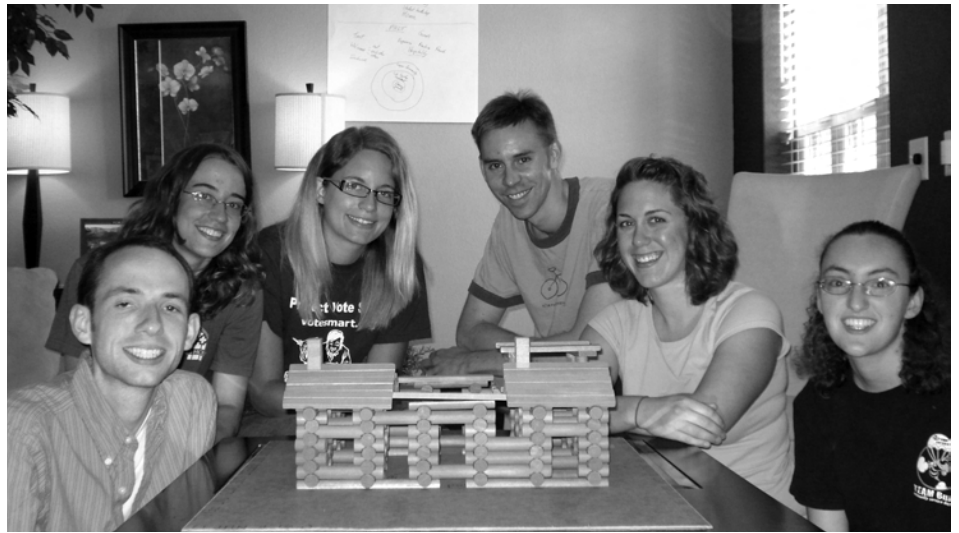
Members of the Pres House Life Together Program take time to build a "physical" representation of the home they want to create for students this year at Pres House.

Funding for the program comes from Christ Presbyterian Church. Members of Christ Church are giving up to $100,000 that will be matched by $50,000 from the church endowment. Over half of that amount has already been given.